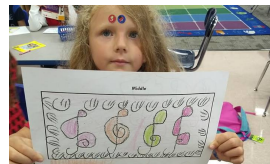
JUNE I CAN DRAW TREBLE CLEF!

FRIDAY, SEPT. 14TH IS A HALF DAY AND SO THERE WILL BE NO MW. PLEASE PLAN FOR YOUR CHILD'S AFTERNOON!